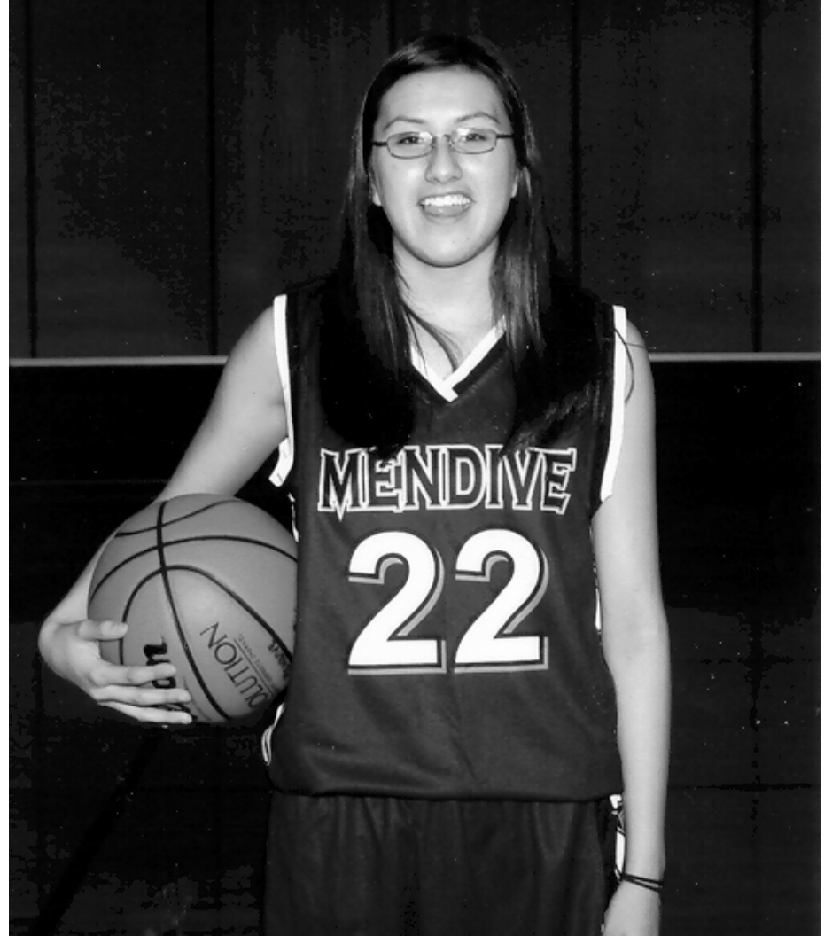
ELKS HOOP SHOOT

We will notify the registered people when the new plastic cards are ready.