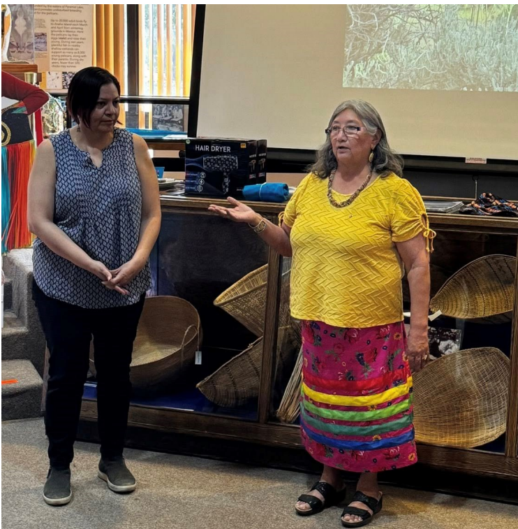
Pyramid Lake Museum & Visitor Center—March 26, 2027:

Protection DP-2: Temporary Stream Crossing- stabilizes & minimizes streambank erosion