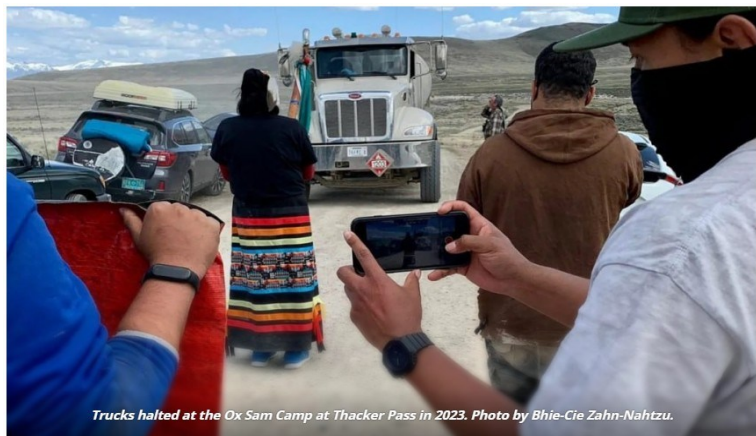
Trucks halted at the Ox Sam Camp at Thacker Pass in 2023.

"The knowledge of a spiritual elder continues as long as even one person is willing to learn," he said, noting a young man in the community has already expressed interest in following his path.